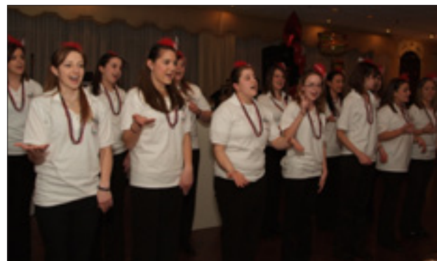
The Res Singers performed at Res-Ma-Tazz .

Thank you to all who supported Res-Ma-Tazz!