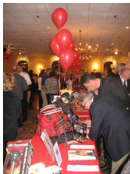
Guests bid on Silent and Live Auction items at Res-Ma-Tazz .