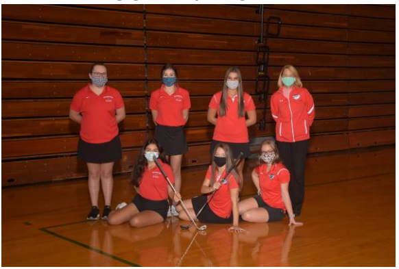
GOLF – JUNIOR VARSITY