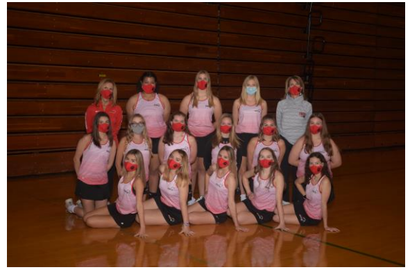
TENNIS – JUNIOR VARSITY